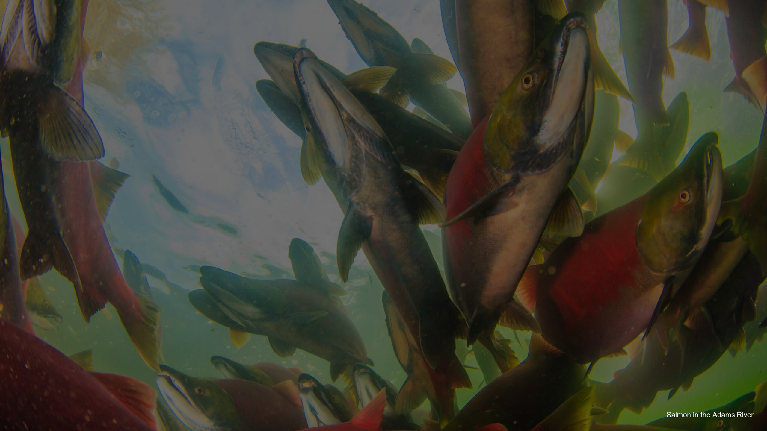
Salmon in the Adams River