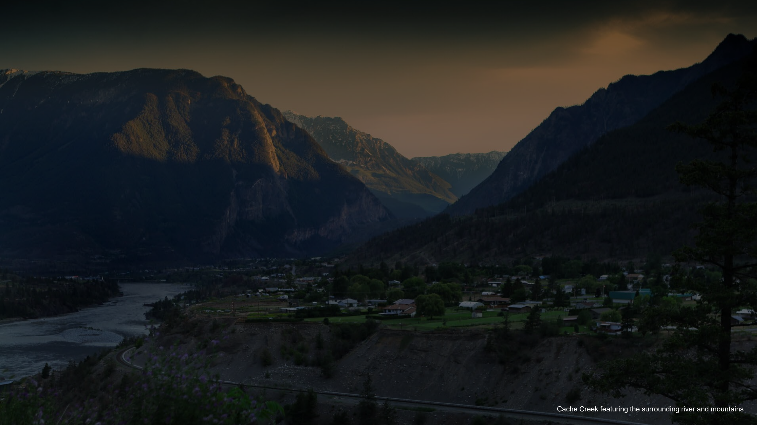
Cache Creek featuring the surrounding river and mountains